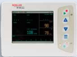
See and hear the Korotkoff sounds using the onscreen display and the included headphones