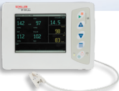
SpO 2 with MASIMO technology (option)