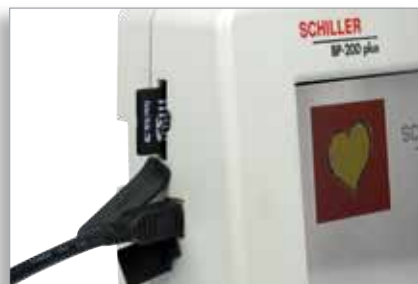
USB interface for calibrating the BP-200 plus and SD card for software update or research work