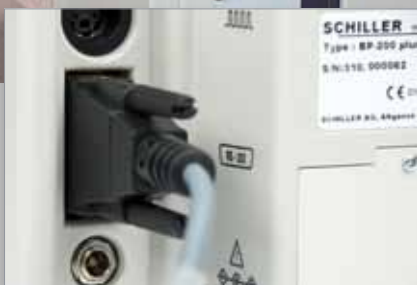
RS-232 capability to most ECG systems