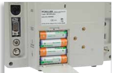
Battery operation (option)

With the BP-200 plus «hands-free» interface, blood pressure readings can be initiated automatically by your stress ECG system at user-defined intervals. After taking a blood pressure measurement, the monitor automatically sends the results to your stress ECG system for immediate display and printout. The BP-200 plus gives you the freedom to concentrate on your patient's performance without the need to manually initiate blood pressure measurements.